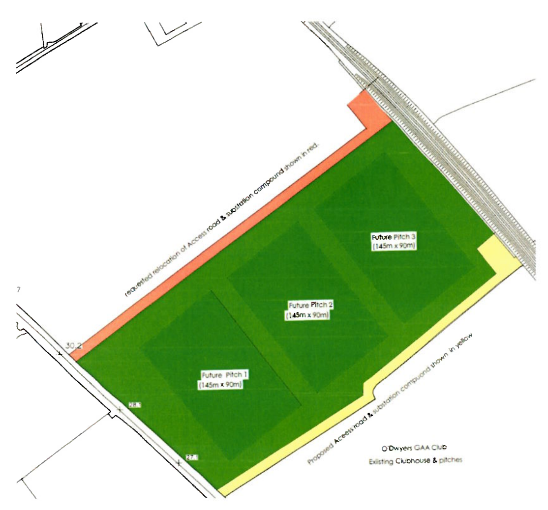
Figure A – Access road currently proposed (yellow) – requested relocation (red)

O'Dwyers welcome the proposal for the Dart+, in principle, as it will bring far more frequent trains to and from Balbriggan and we understand the need for associated infrastructure. As an important sporting organisation in Balbriggan we also must be prudent and plan for the future of our Club and its members and with Balbriggan continuously growing in population we respectfully request that larnrod Eireann in planning for increased capacity of public transport in Balbriggan and Dublin North, also assist O'Dwyers GAA Club in planning for increased membership and additional pitches in the future by moving the access road by a minimum of 200m northwards.